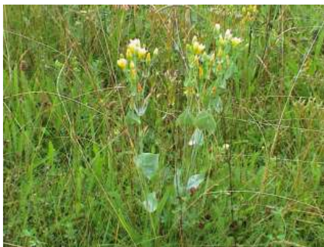
Yellow-wort in re-created chalk grassland